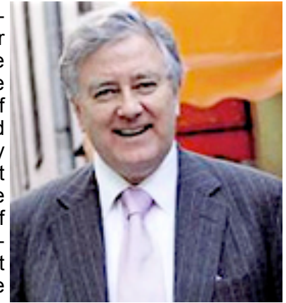
Former Senator Larry Pressler

“As a life-long Republican, I stand by him as he stands by all of us, putting national allegiance ahead of party affiliation. I endorse President Obama for reelection in 2012.”